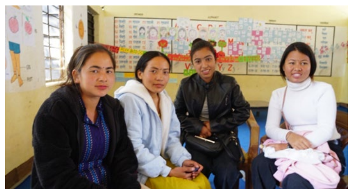
Tuition teachers for two schools